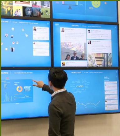
Curtin Business School