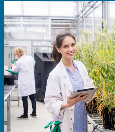
Science & Engineering