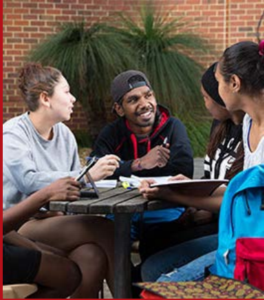
Centre for Aboriginal Studies