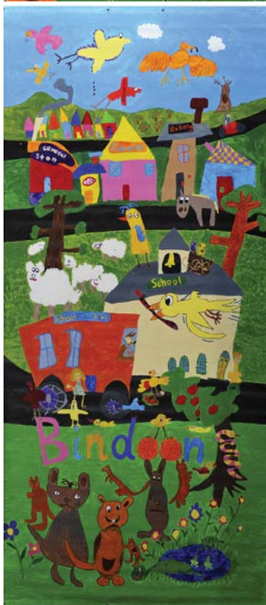
Top: 2014 Winning Design "Bindoon Historical Society"